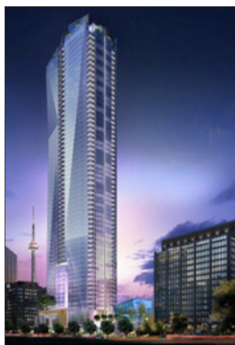
Toronto's Shangri-La hotel-residential project is slated to open next year.

Residences at the Toronto Shangri-La start at $1 million for a 1,100-square-foot suite. Private estates are priced from $2.7 million and the penthouses are selling for $18.8 million each. The project went on sale back in 2007 and is around 75 per cent sold at the moment, Braun says.