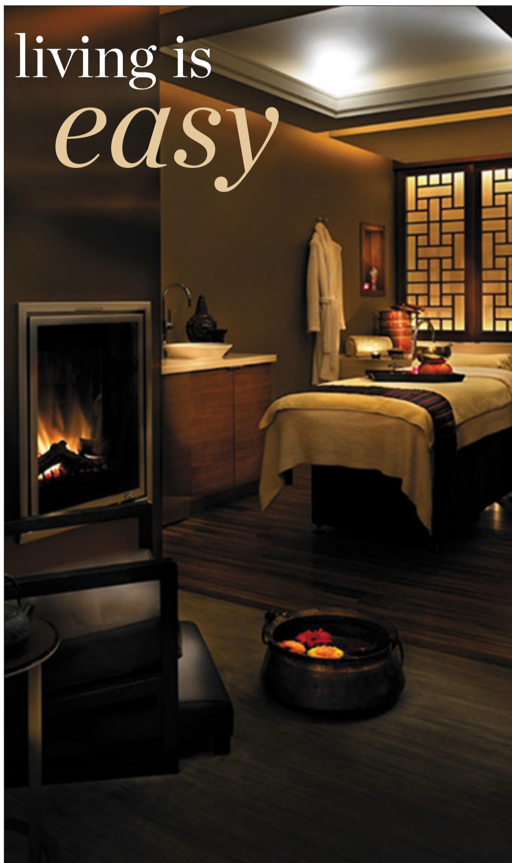
The Chi Spa at Shangri-La's Vancouver location epitomizes luxury living and the same level of five-star services will be available to residents at Toronto's new Shangri-La hotel and condos.